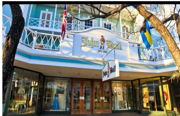
John Bull's, 284 Bay St., Nassau, Bahamas